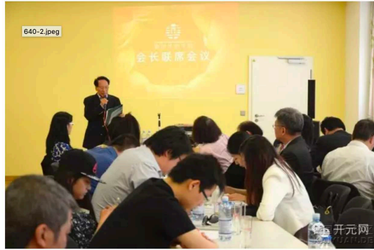
A 2015 meeting in Frankfurt discusses the establishment of “Chinese Aid Centers” in Germany. According to a 2016 report in the Chinesische Handelszeitung , the centers help China’s five regional consulates in Germany to find students who have “lost contact”, and offer translation, and legal and medical aid. 9

ciety – even many Chinese and non-Chinese members may be unaware of their exact nature or function – and likely number over a thousand, since they are present (with some variation) in every country. 8