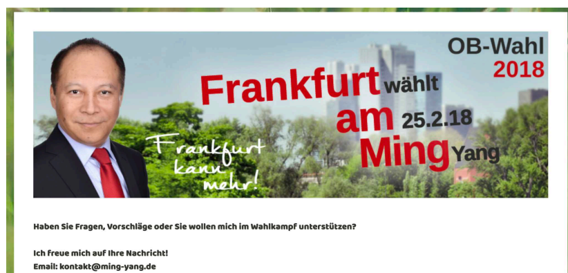
Yang Ming's mayoral campaign website.